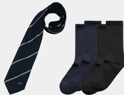
Navy blue tie with skye/white stripe and logo. Long or short navy or black socks must cover the ankle bone.