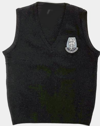
Dark navy wool knit vest with school logo.