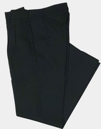
Plain dark navy trousers, school set only.