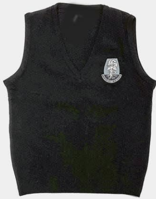
Dark navy wool knit vest with school logo.