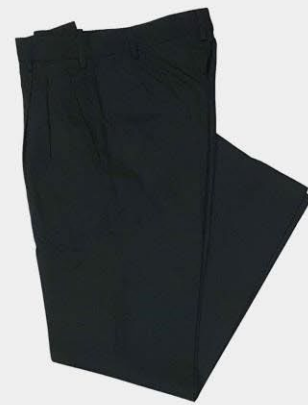
Plain dark navy trousers, school set only.