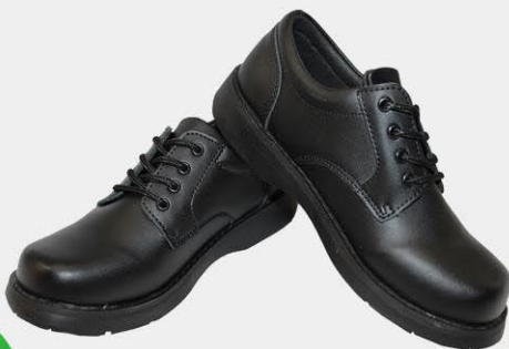
Polished black leather lace up school shoes, no high heels, platforms, canvas sneaker style shoes or boots.