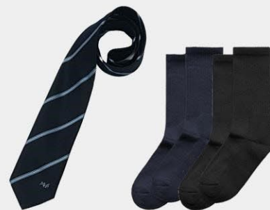
Navy blue tie with skye/white stripe and logo. Long or short navy or black socks must cover the ankle bone.