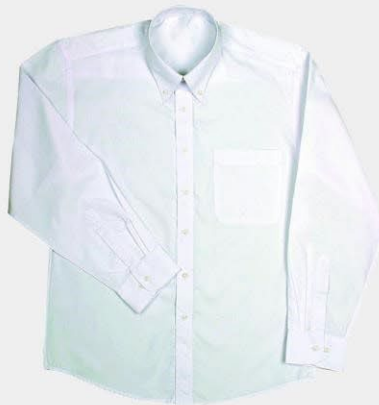
White long sleeved, business shirt (no logo).